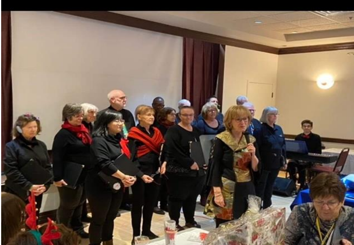
Lakeshore Community Choir