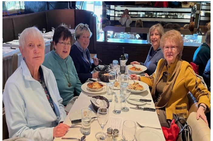
Luncheon at L'Académie in Pointe Claire