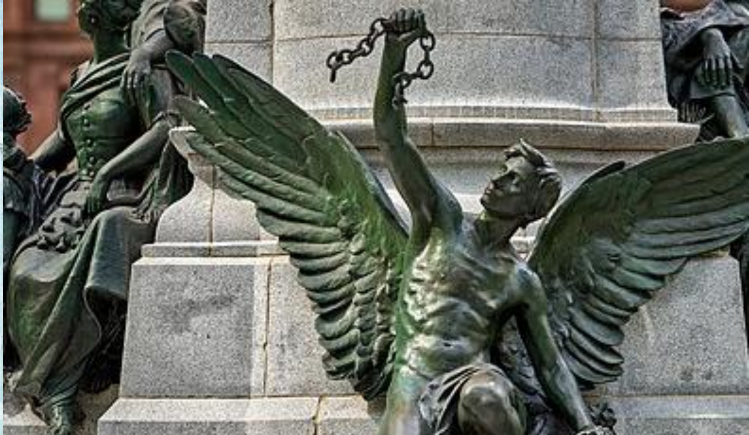
Maisonneuve, John Young, Jeanne-Mance, Mgr Bourget, Edouard VII (Philipp's Sq.), Cathédrale Marie-Reine du Monde, Crémazie and many more in Montreal, Quebec, Ottawa