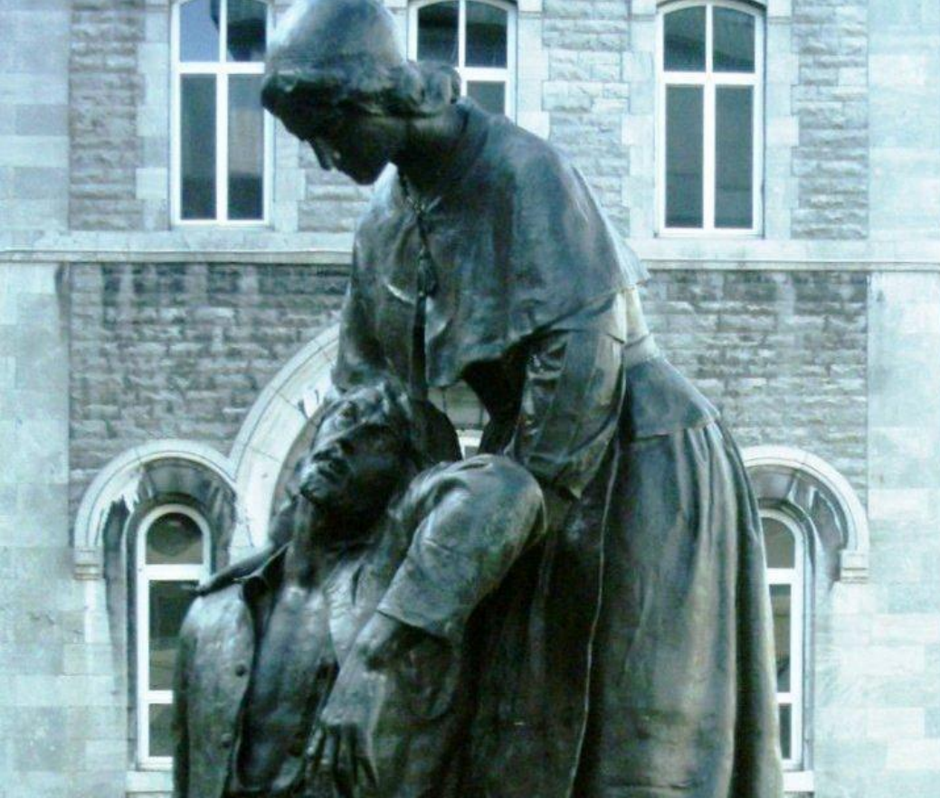
Louis-Philippe Hébert, national sculptor, 1850-1917