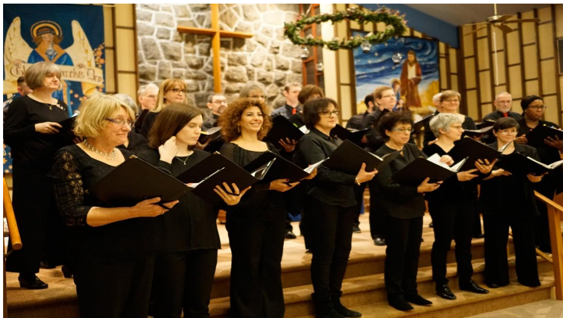
Members of the Philomela Choir who regaled us with beautiful Christmas music.