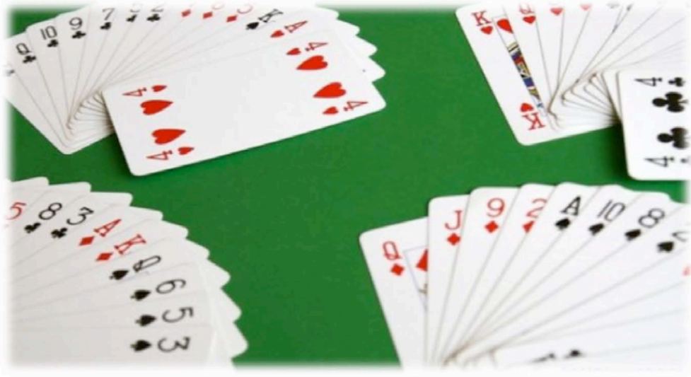
Table sociale disponible / Social table available

Venez partager un lunch et jouer au bridge avec vos amies !