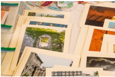
Photocards on display