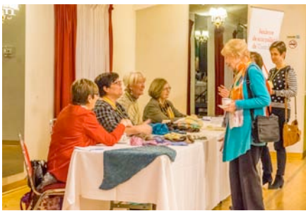
Fellow members admiring the knitting