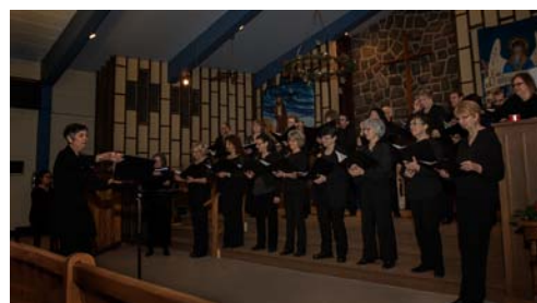
The Philomela Choir entertaining us