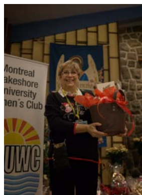
Gilda delivering raffle prize to lucky winner