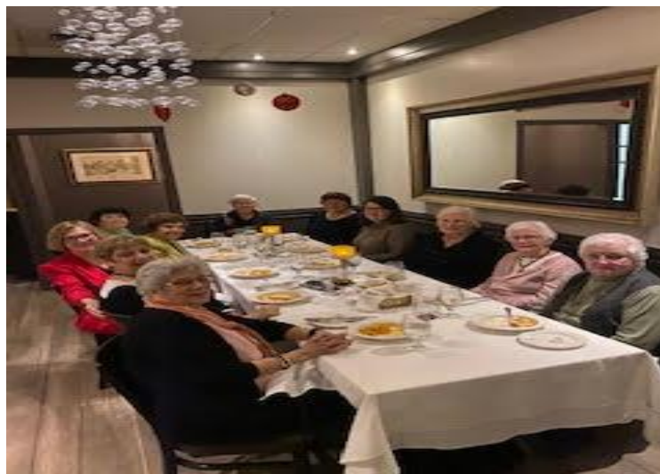
Dinner at La Serenata